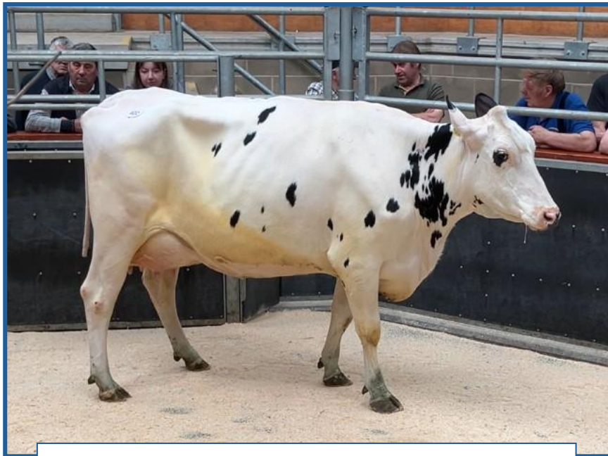
May Day Champion 2025 sold to £3100

Mules Ewes with Triplets - £78 Sea View (Lamb)