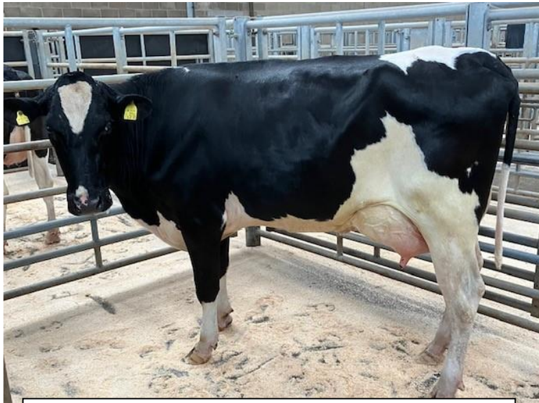
WM Dotchin, Cumcatch Farm sold a run of four Cows and Heifers to £1300

Holstein Cows - £1620 Round Hill Farm (Round Hill Farm Ltd) £1250 Cumcatch Farm (Dotchin)