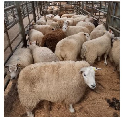
RN Scott, West Micklethwaite sold 24 Beltex Hoggs to 464.3pkg (£195) and an average of £168.85.