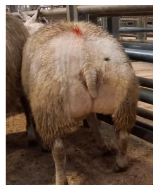
WW Gate, Low Aketon sold a run of 13 Beltex Lambs to a top of £167 and an average of £156.27.