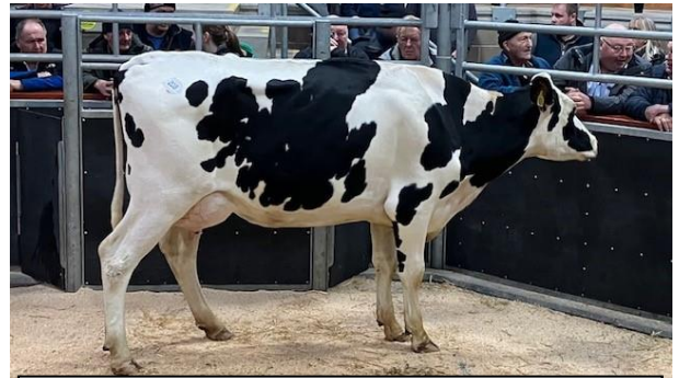
Lot 228 – Reserve Champion and second Holstein Cow from Gerrard House Farm Ltd, sold for £2200