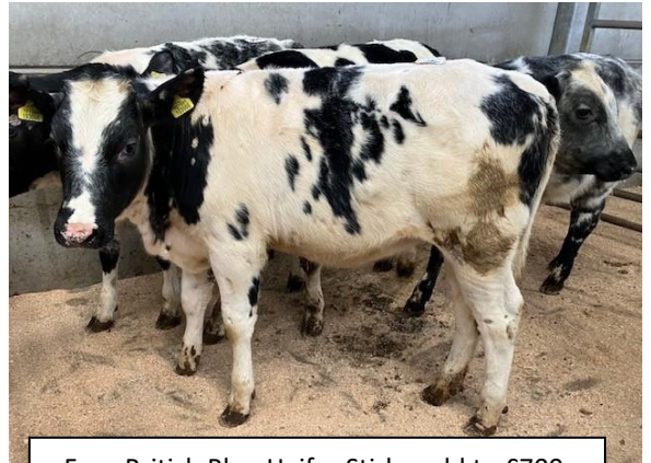
Four British Blue Heifer Stirks sold to £700, twice, and an averaged £670 for Messrs Hughes, Seaville Farm

Holstein Cows £1700 £1380 How End Farms (Swainson) £1680 Fairladies Farm (Clark)