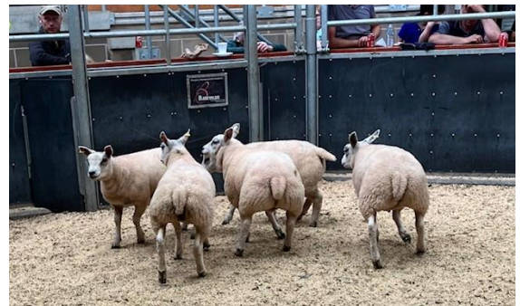
AW Hague, Mill Street sold a lovely run of 61 Beltex Store Lambs, this pen of 5 sold to £132 and the whole consignment averaged £112.23.