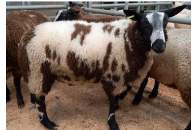
Dutch Spotted Lambs sold to 286.0pkg (£140) for L Hunt, Croft House