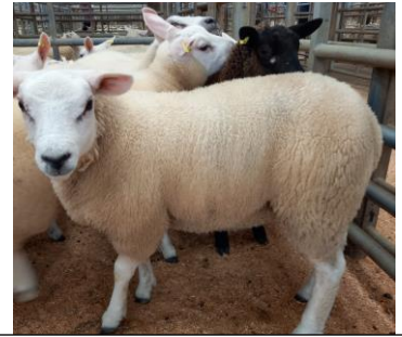
A run of 15 Texel Lambs sold to 333.3pkg (£144) and averaged £141.53 for Messrs Cape, Kirkland Guards