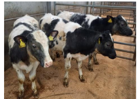
A run of British Blue Bull Stirks sold to £605 and averaged £581.25 from D & P Tiffin & Sons, Swinsty Farm

Limousin Heifer Calves £250 Plumbland Farm (Eilbeck) £230 Wheyrigg House (Evans)