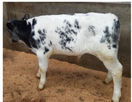
A cracking 7 week old British Blue Bull Calf sold to £330 for J Bailey, Moorhouse Hall Farm