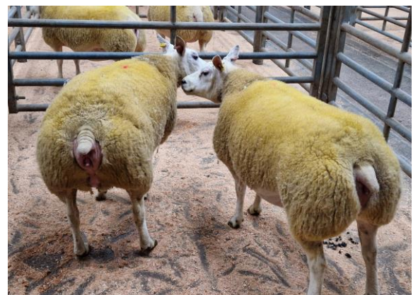
Pairs of In Lamb Gimmer Shearlings sold to £280 on four occasions for Messrs TC Whiteford, Tercrosset

More Ewes with Lambs at Foot required for the next sale, contact David Fearon on 07500 173273