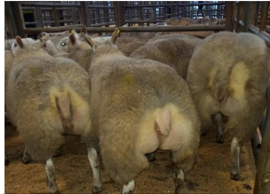
A super run of 13 Dutch Texel Hogs from David Batty, Cobble Croft topping the market at £169 and averaging £150.88

Charollais 240.7 232.1 214.1 Thistle Bottom (Paterson)