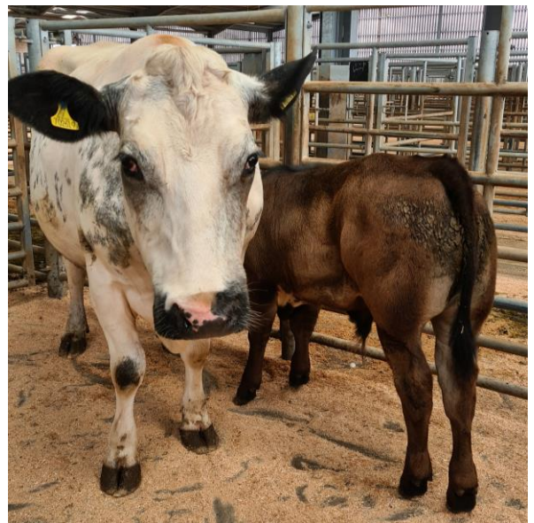
Top price British Blue Cow & Limousin Bull Calf today from R A Baird, Wampool Farm, Wigton

Limousin Heifer Calves £365 £310 (2) Roundhill Farm (Harrison)