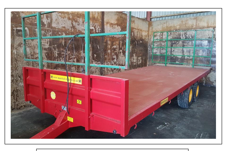
Marshall Bale Trailer