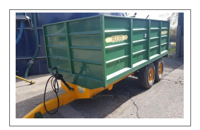
Fraser 12ft Grain Trailer