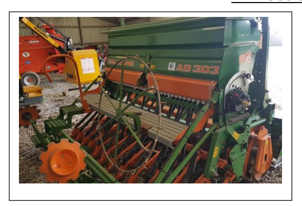
Amazone AD303 Combi Drill 1,941 acres sown