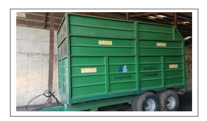
Fraser Silage Trailer