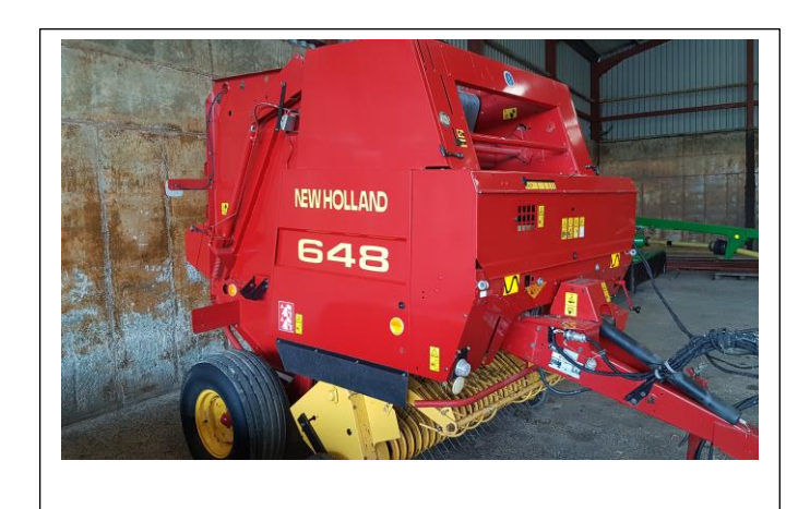
New Holland 648 Round Baler

Allman 1200 litres spray – Electric controls, hydraulic