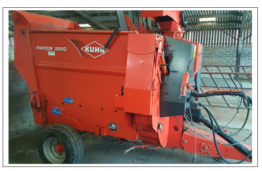
Kuhn Primor 3560