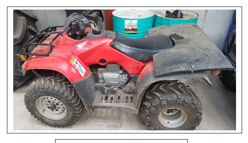
Honda Quad Bike 2 Wheel Drive