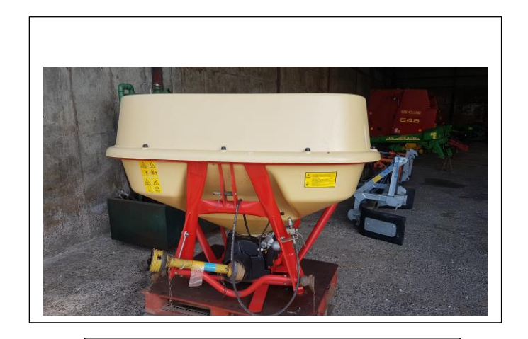
Vicon Fertiliser Spreader