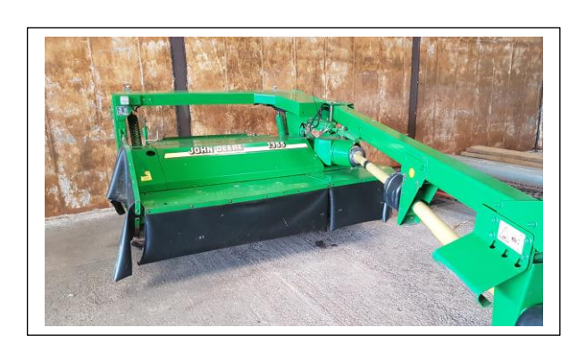
John Deere 1355 Mowing Machine