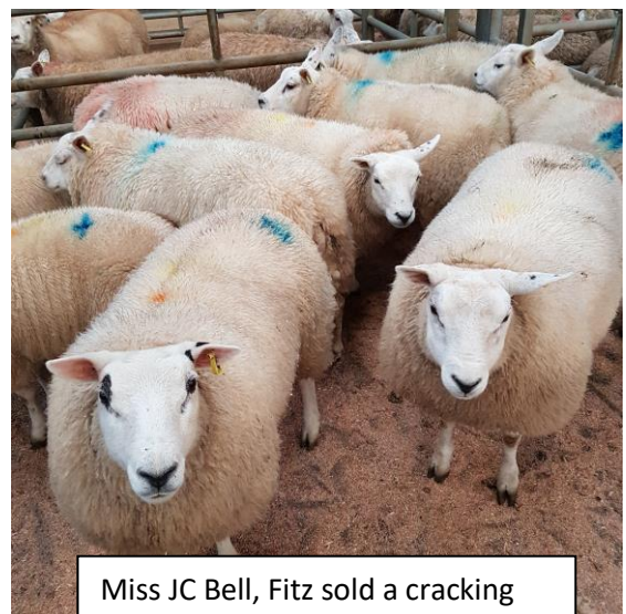
Miss JC Bell, Fitz sold a cracking run of 10 Hogs to a top of £141 and an average of 138.60