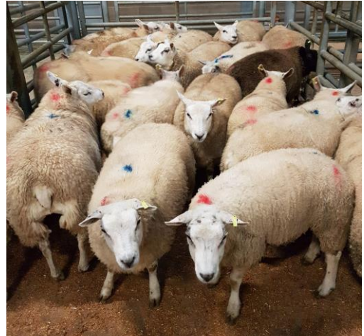
Messrs Dickinson, Low House sold 23 Texel Lambs to £159 and an average of £137.52 and average 313.49pkg