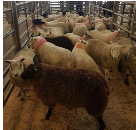
MJ Lawson, Pasture House sold a run of 111 Lambs to an average of £136.46 with a top price of £168 for a pair of lambs weighing 46.5kg