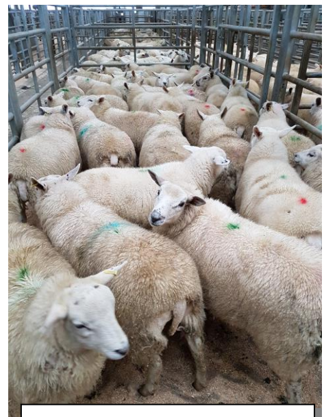
Marsh House Farming sold a run of 169 Texel Lambs to an average of £117.53 with a pen of four 43kg lambs to £144.50