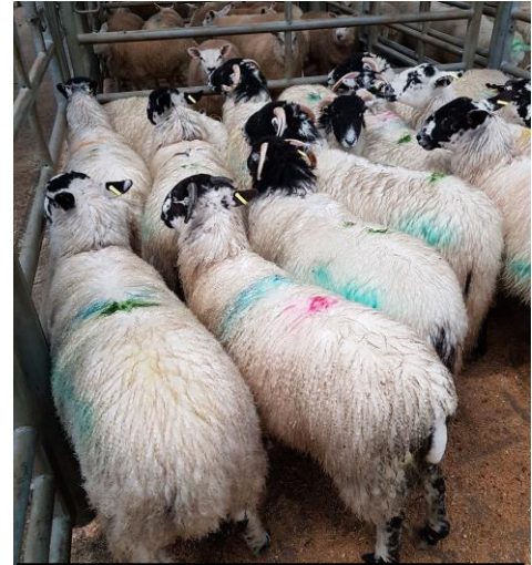
Messrs Watson, Paddigill sold 11 Mule Lambs to £132 and 7 Swaledale Lambs to £95.50

Dutch Texel 380.6 376.3 365.4 313.7 Cobble Croft (Batty) 377.6 356.0 338.0 324.1 319.2 308.0 294.5 288.9 280.7 The Laurels Farm (Steel)