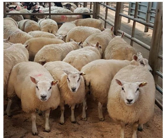
Messrs GN Bowe & Sons, Bothel Parks sold a lovely run of 19 Texel Lambs to an average of £153 per head and to a top of £170