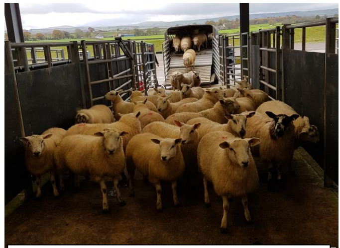
Unloading 41 Lambs from Greystoke Castle Farm for Messrs Peile, which later went on to sell at an average of £123.68

Mule £95 Prior Hall (Hall) £91 Fairfield Farm (Fotheringham) £88 Fellside House Farm (Pears)