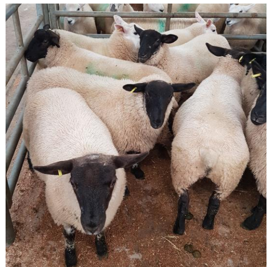
A lovely run of 11 Suffolk Lambs and 4 Texel Lambs averaged £108.67 for Messrs Fisher, Dufton House