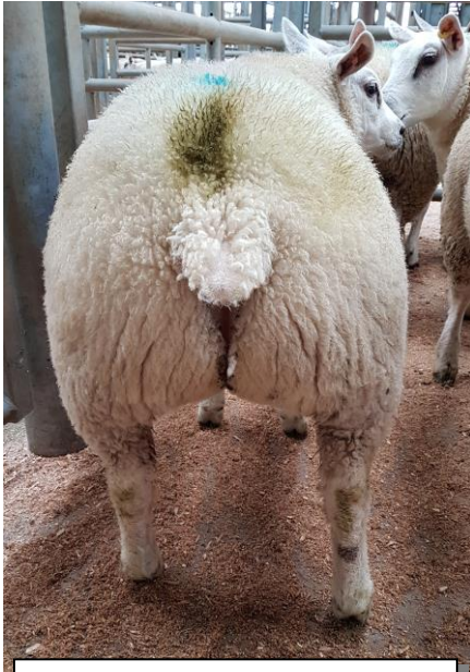
12 Lambs from WW Gate, Low Aketon averaged £126.88 per head

£121 £120 Priestcroft (Raven) £127 £126 £123 Westward Parks (Brockbank) £126 x 2 East Park (Donaldson) £126 £120 Hudscapes (Cowx) £126 Mechi (Bowe) £125.5 Riggwood (Harrington) £125 £123.5 x 2 £121 £120 Borranhill (Wybergh) £124 x 2 Green Farm (Mattinson) £124 Blackburn Farm (Thorpe) £122 High Hall (Thompson) £120 Newton Field Farm (Beaty) £120 High Blaitwaite (Spark) £120 Low Aketon (Gate)