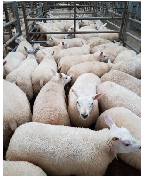
310 Prime Lambs from B Blandford & Sons, Netherton Farm averaged 322.34p/kg (£119.91)

Texel £172 £135 Hill House (Harrison) £152 £139 £133 £128.5 £125 Bothel Parks (Bowe) £146 £124 £122 Hall Oven (Davidson) £138 £128.5 Leesrigg (Carr) £138 Allerby Hall (Miller) £135.5 £124.5 Downhall (Harrison) £131 Prospect House (Hodgson) £130 £126 £123.5 £123 Wellington Farm (Harrington) £128.5 Croft House (Hunt) £127.5 £121.5 x 2