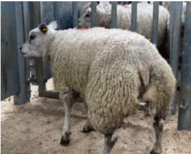
A consignment of 9 Beltex Hogs from D Jones, The Croft averaged £156.78 per head and 361.79pkg

Mule £105 Fordham Farm (Foster) £104 Lowlands (Peile) £102 Beck Farm (Harrison) £102 Swinsty Farm (Tiffin)