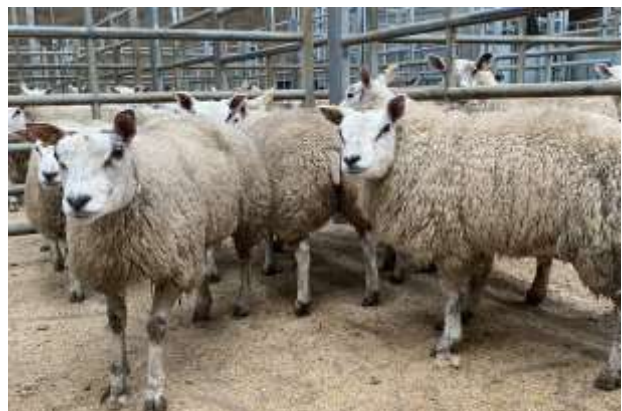
A consignment of 22 Dutch Texel hogs from David Batty, Cobble Croft averaged £143.48 per head and 365.75pkg

Suffolk X 261.5 241.8 235.3 Allerby Hall (Miller)