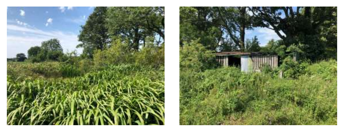
Pond and dilapidated tin stables

The property will be offered for sale by Private Treaty in one lot. Offers are to be made in writing to the Sole Agents. The Vendors reserve the right to sell the property without setting a closing date and any potential purchasers are therefore advised to register their interest with the Sole Agent. The Vendors reserve the right to amend the sales particulars.