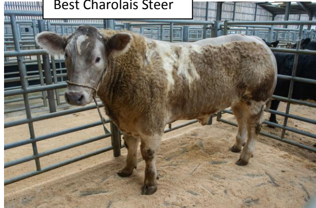
Best Charolais Steer