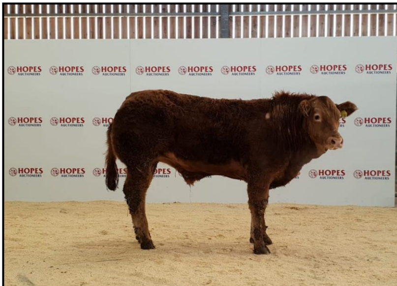
Champion – A Wagstaff, Pond House